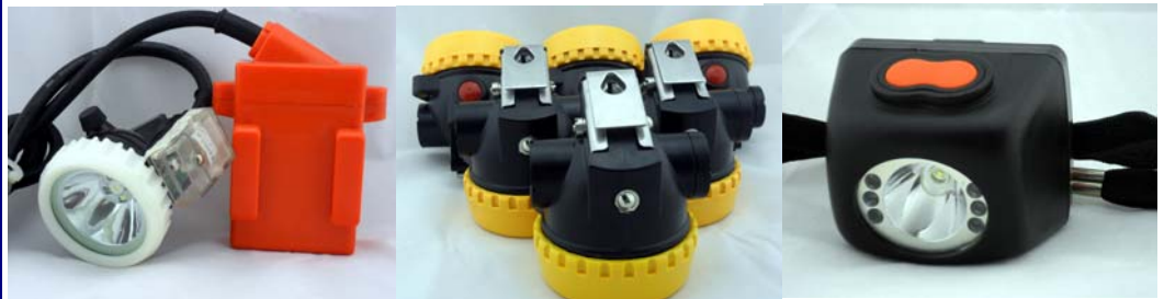
CM-KL6LM(MH) with Gas alarmer

To protect workers' eyes, the colour temperature of the LED we use is less than 6,500K. The Lighting intensity of SuperLED Miners Lamps is range from 3000Lux to 15,000Lux. (SuperLED Miners Cap Lamp aim to protect Workers's safty and lives.)